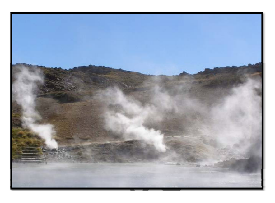
Figure 2- One of the many high quality surface manifestations in the Copahue concession, in this case a Las Maquinas.

Earth Heat Resources Ltd Registered Offices