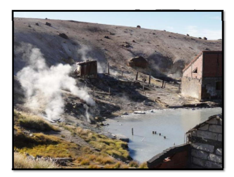
Figure 3- More imagery from the Las Maquinas area, showing the historic relationship between man and geothermal activity.